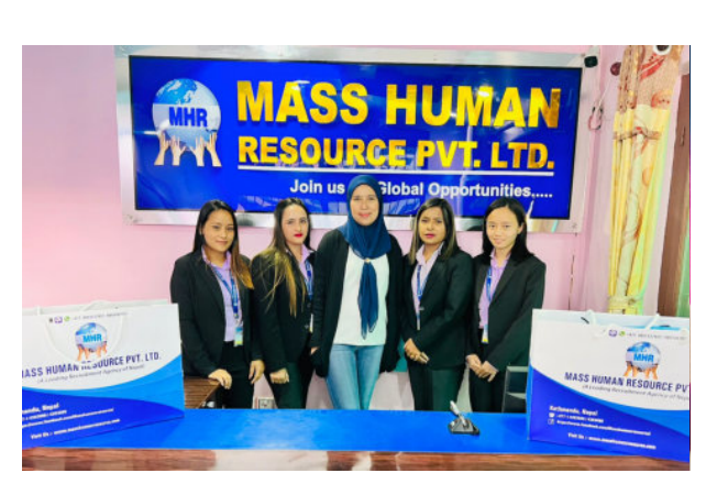
Client visit at MHR