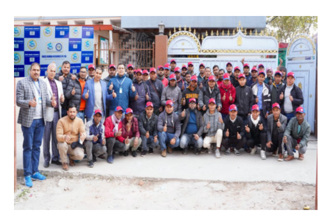
During The Departure